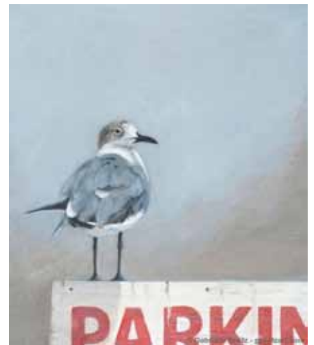
Following Orders - acrylic on paper 13.5" x 10.5"