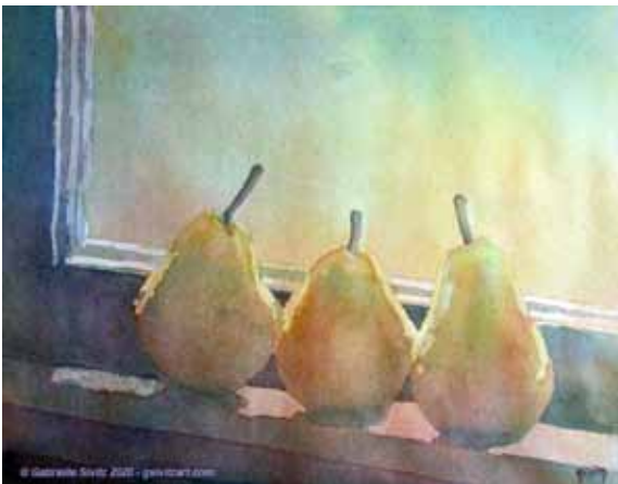
Pears With A View - watercolor using a poured technique 11" x 14"

It's impossible to choose just one, but there's definitely a chocolate theme in my top picks: Chocolate Cookies & Cream and Milky Way (Bredenbeck's, Chestnut Hill, PA), Dark Chocolate & Orange (Penny's Ice Cream, Lancaster, PA), and Mexican Chocolate (Big Dipper, Missoula, MT)